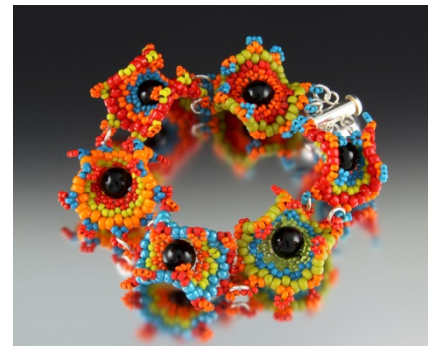
Curvaceous Bulls-Eye Bracelet

4. Circular Peyote - Cellini spiral or peacock petals (step-ups and graduated beads and different styles of beads). Kits available.