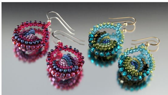
Peacock Petal Earrings

4. Circular Peyote - Cellini spiral or peacock petals (step-ups and graduated beads and different styles of beads). Kits available.