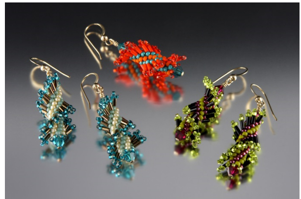
Tantalizing Twist Earrings

3. Finish Tantalizing Twist Earrings - learn how to make wire-wrapped loops; start learning odd count peyote (work on beaded square pattern from class 1 to make ornament, or card – beads included for beaded square ).